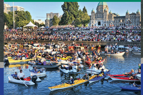
Symphony Splash, Inner Harbour

The Greater Victoria School District No. 61 (SD61) wishes to recognize and acknowledge the Esquimalt and Songhees Nations, on whose traditional territories, we live, we learn, and we do our work.