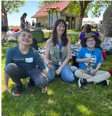
May 28 - Deaf and Hard of Hearing Beach Day