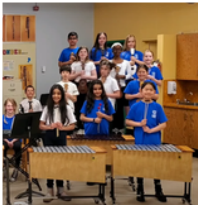
Jun 2 - Torquay Elementary Named Top Ten CBC Music Challenge