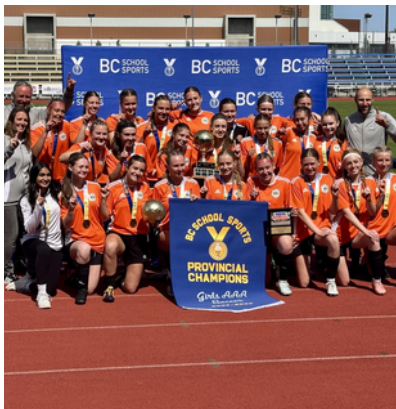
May 31 - Spectrum Sr Girls Soccer Wins Provincials