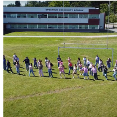
May 30 - Spectrum Celebrates 50 th Anniversary