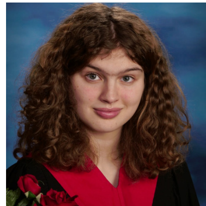
June 17 - Esquimalt High Student Awarded $100,000 Schulich Leader Scholarship