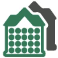
Capacity of Schools