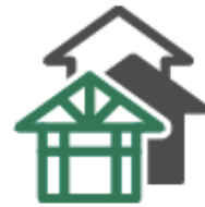
Future Housing Starts