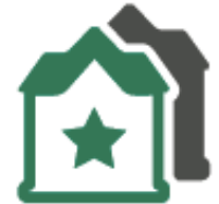
Schools of Choice (Cloverdale, South Park)