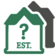
Age of Current Infrastructure