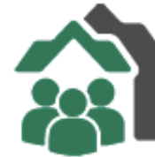
Current Student Enrolment