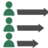
Student Enrolment Priorities