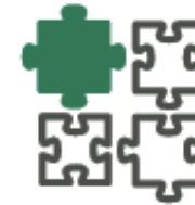
Programs of Choice (French Immersion, Sports Academies, etc.)