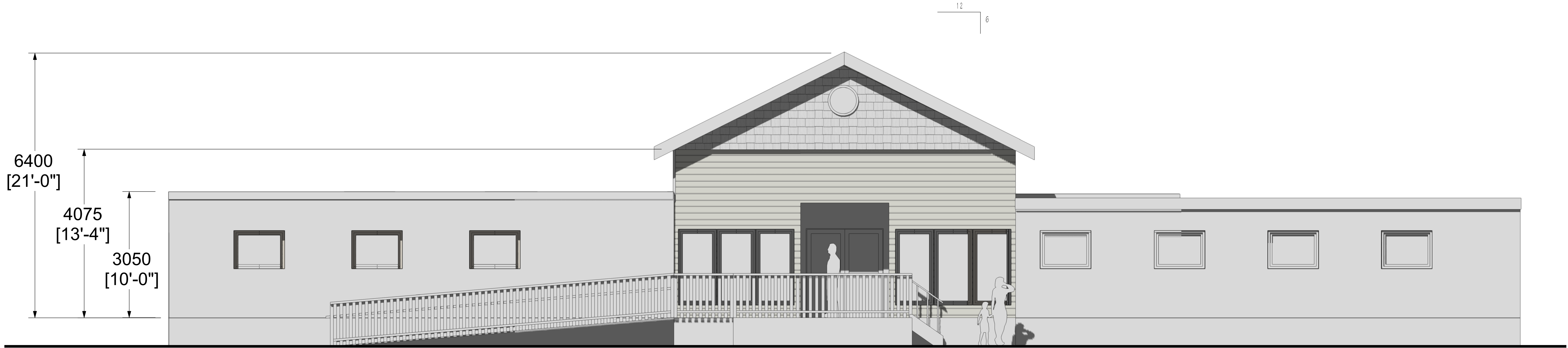
1 A-2.1 CONCEPT EAST ELEVATION SCALE: 1:50