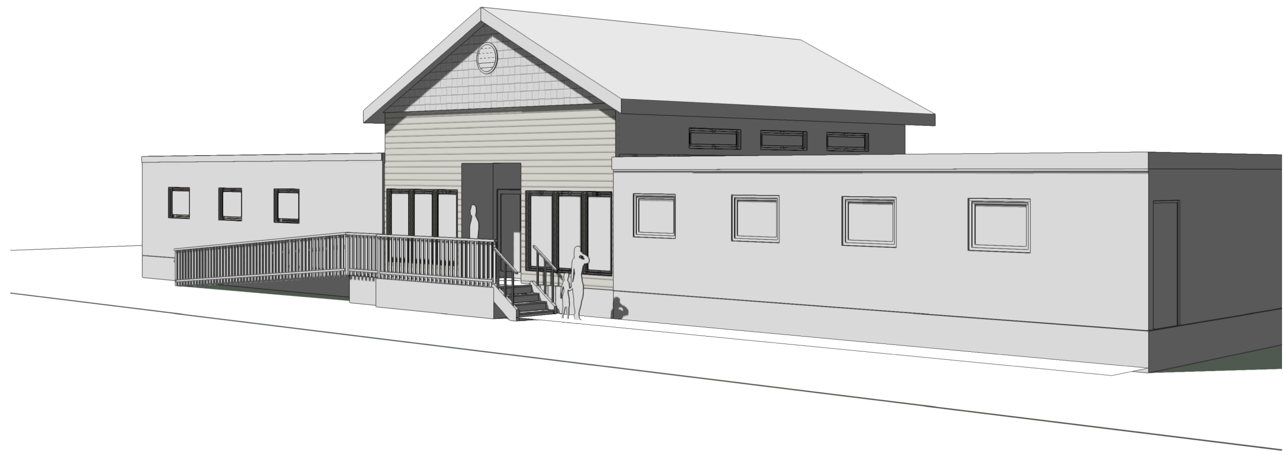
2 A-2.1 CONCEPT 1 - PERSPECTIVE VIEW NOT TO SCALE