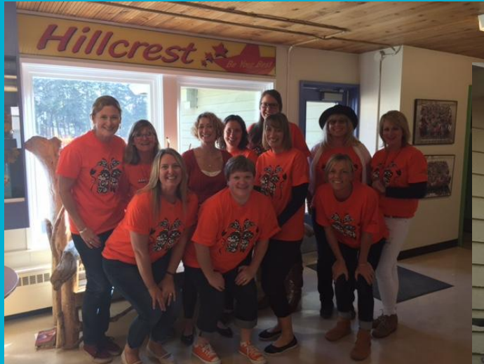
Orange Shirt Day