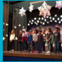
1st winter concert in 10 years - Dec 2016