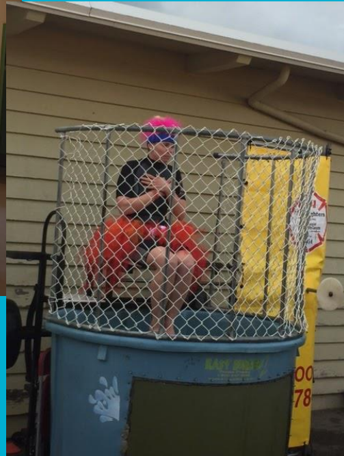
Staff braving the dunk tank