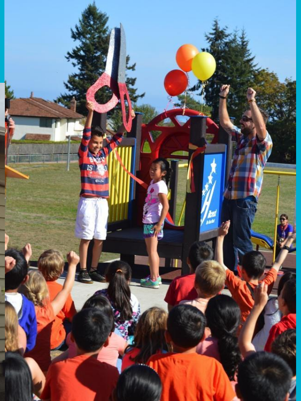
Celebration of our new playground