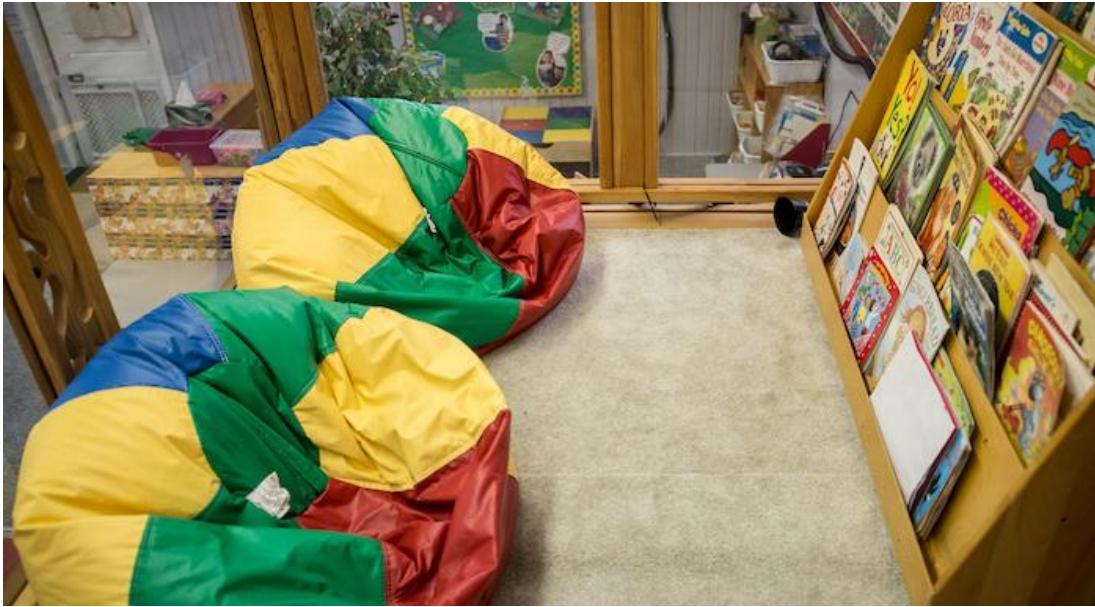
Reading loft, designed, paid for, and built by parents.