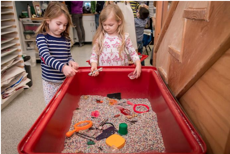
Sensory table, all preschool sized.