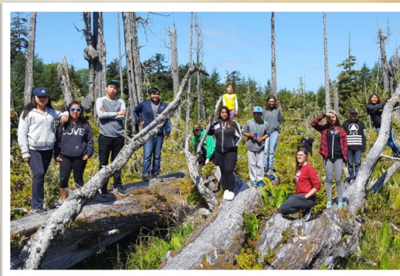
Esquimalt High School