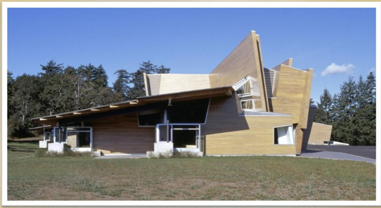
Strawberry Vale Elementary