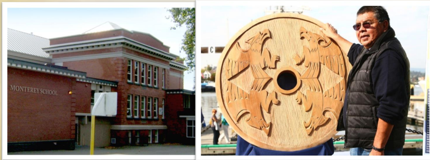
Monterey Middle School