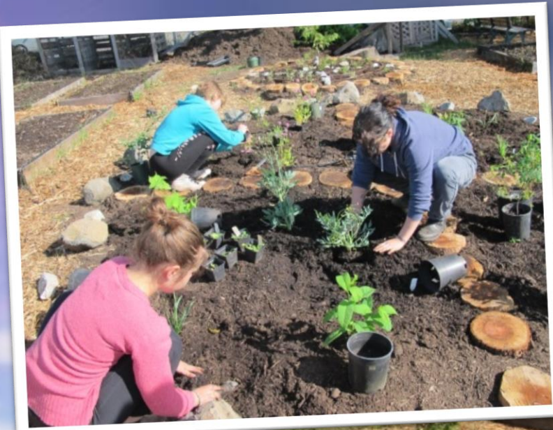
Indigenous Garden at Vic High