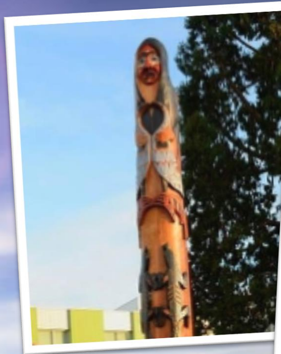
Totem Poles at Quadra Elem. & Oak Bay High