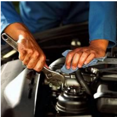
Reynolds Auto Mechanics 11/12 class needs work to do! Donate a vehicle for a tax credit or let us keep your car in top shape with free servicing and discount parts.