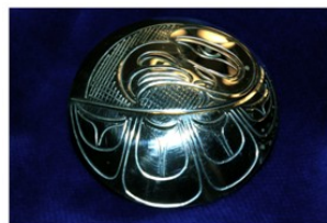
Sun Pin Pendant