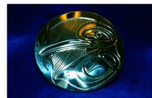
Hummingbird Pin Pendant

Bracelet 1/4" $ 55.00 each 3/8" $ 65.00 each 1/2" $ 85.00