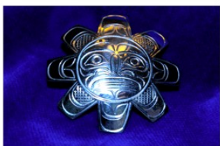
Eagle Pin Pendant