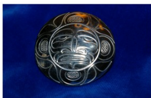
Moon Pin Pendant