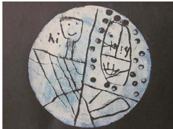
By Evan—Grade 4