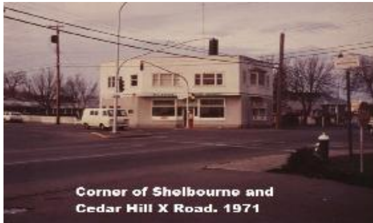
Corner of Shelbourne and Cedar Hill X Road. 1971